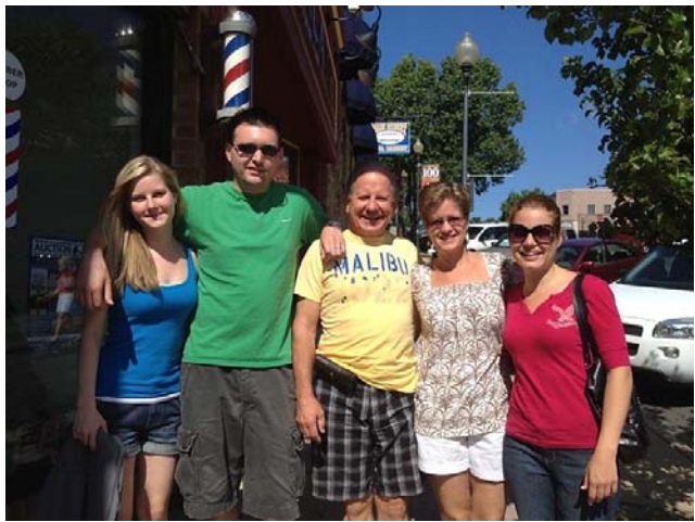
Fun times with Family