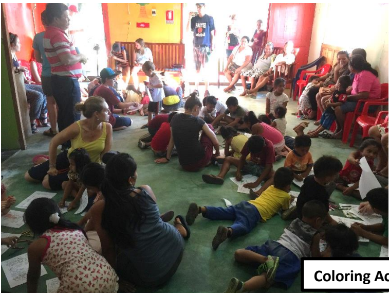
Coloring Activity Pages