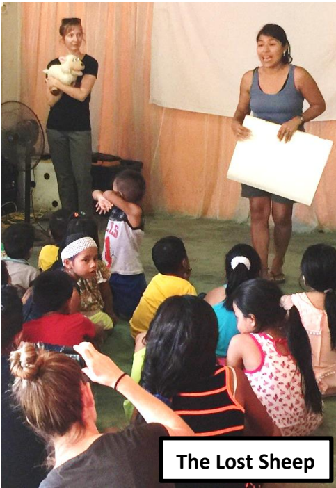
The Lost Sheep