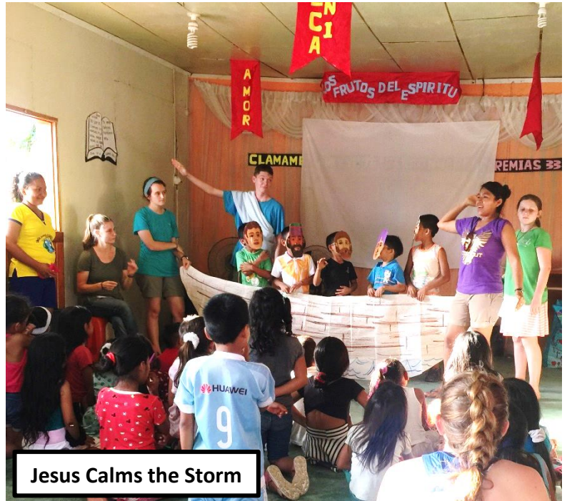
Jesus Calms the Storm