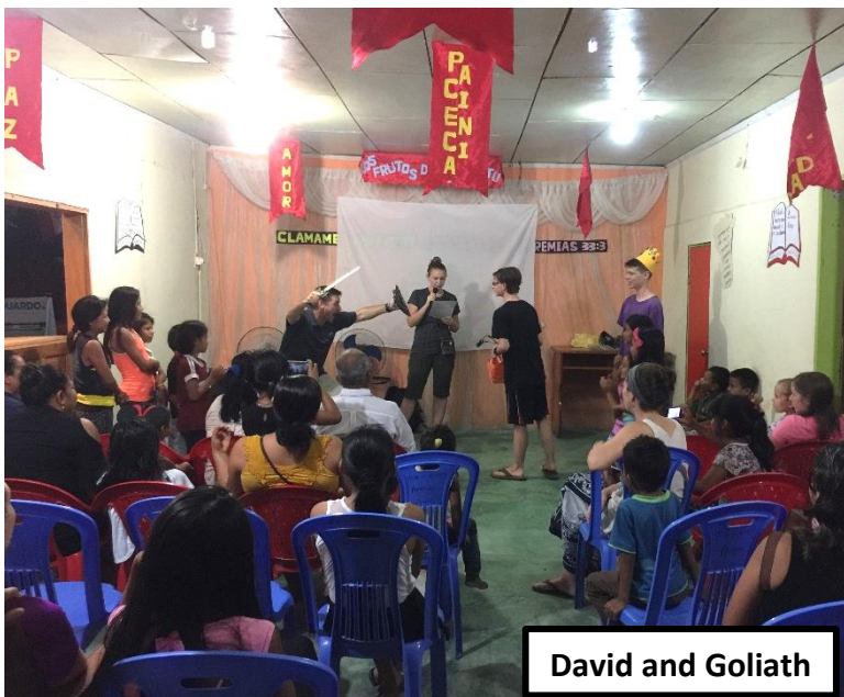
David and Goliath

Our time of praise and worship with the kids was awesome. It was wonderful just showing the kids God's love and sharing His plan of Salvation with them.