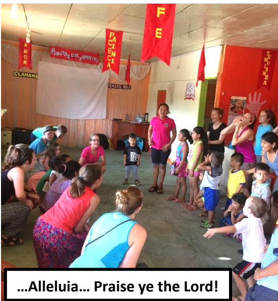
...Alleluia... Praise ye the Lord!