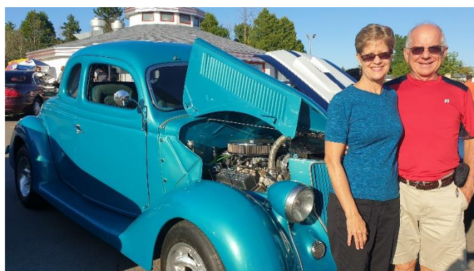
Seeing antique cars with friends (right)

Shortly we will be heading towards IL for a few days, MO and then on to TX for our last week in the USA. We praise God once again for blessing us with so many amazing moments and giving us oodles of precious memories. Thank you for upholding all our travels and visits with your faithful prayers and support, giving us such warm welcomes and for sharing your homes and lives with us along the way!