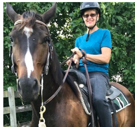
It was fun living outside the box for a while, being a little crazy, adventuresome and spontaneous! 😊