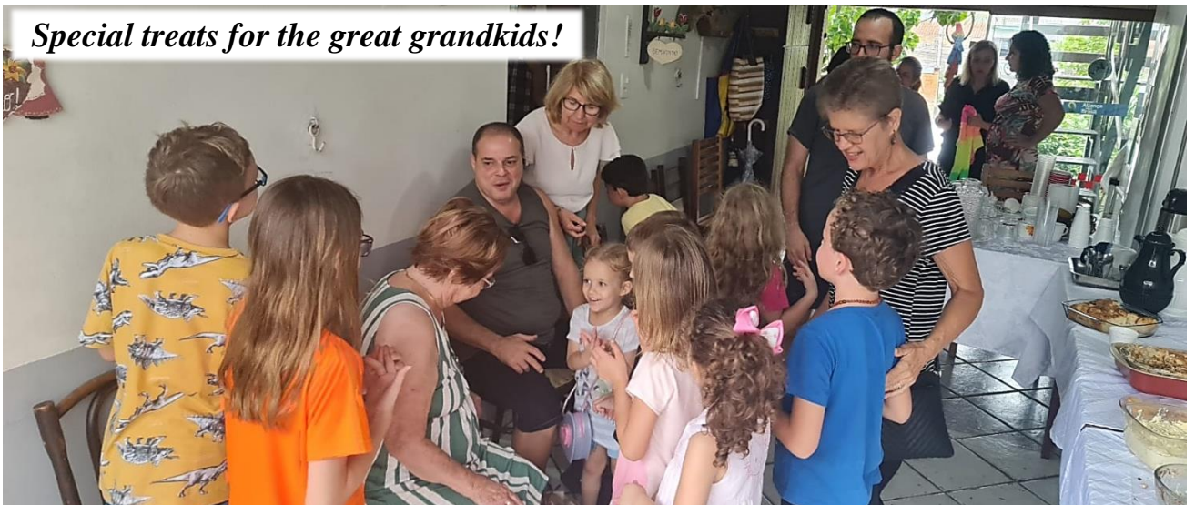
Special treats for the great grandkids!