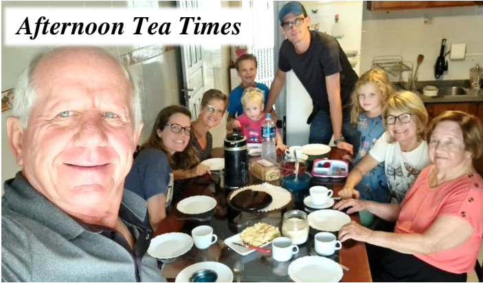
Afternoon Tea Times