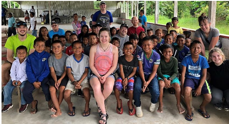
Ministering to the children.