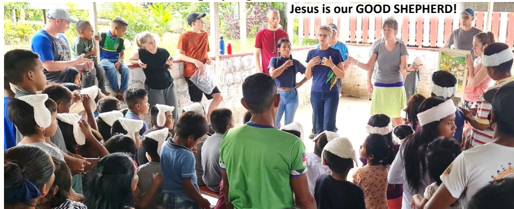
Jesus is our GOOD SHEPHERD!