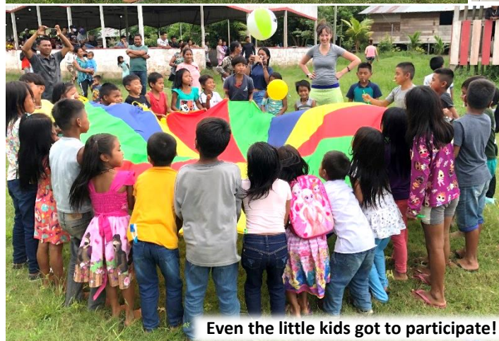
Even the little kids got to participate!