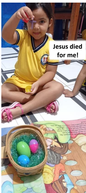
Jesus died for me!