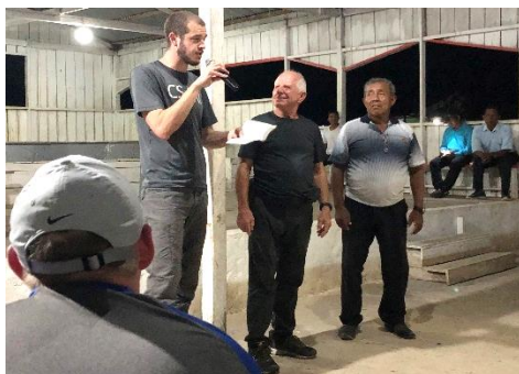
Preaching the Word.