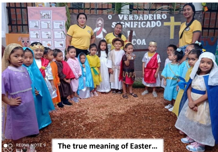
The true meaning of Easter...