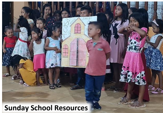
Sunday School Resources

children a fluoride treatment and told them a Bible story. We also participated in the Sunday evening service.