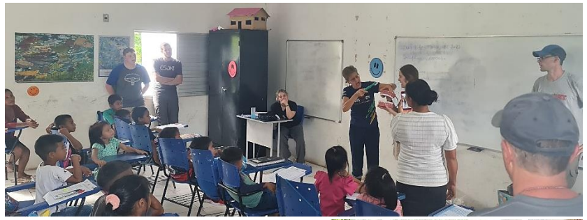
Teaching dental hygiene.