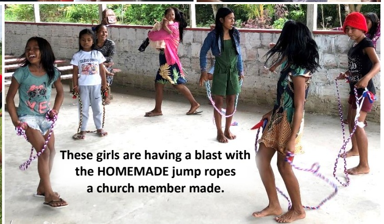
These girls are having a blast with the HOMEMADE jump ropes a church member made.