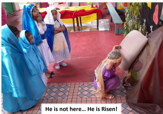
He is not here... He is Risen!