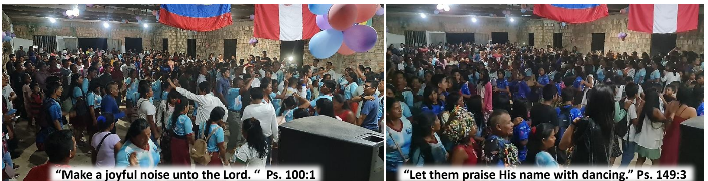
"Make a joyful noise unto the Lord." Ps. 100:1

You may wonder why they left the large space in front of the church?! After each group gave their presentation, this area was packed with people praising and dancing before the Lord! Several gave their lives to Christ and others dedicated their lives to the Lord's service.