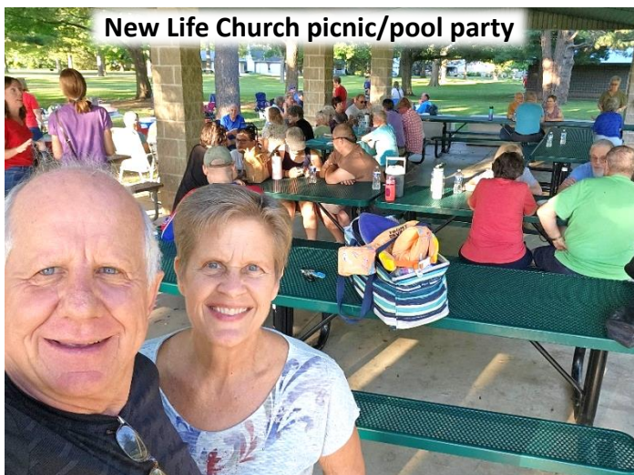
New Life Church picnic/pool party

That night we went to the church picnic/pool party. It was great getting to know more of the church family! 😊 The following evening, we met with the Global Mission Team from New Life, enjoyed an amazing fish dinner together (fresh from Canada!) and had a special time sharing.