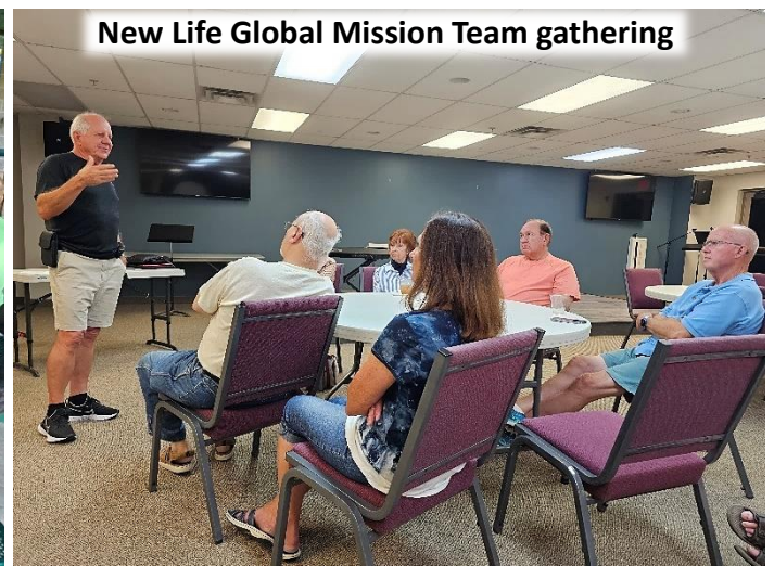
New Life Global Mission Team gathering