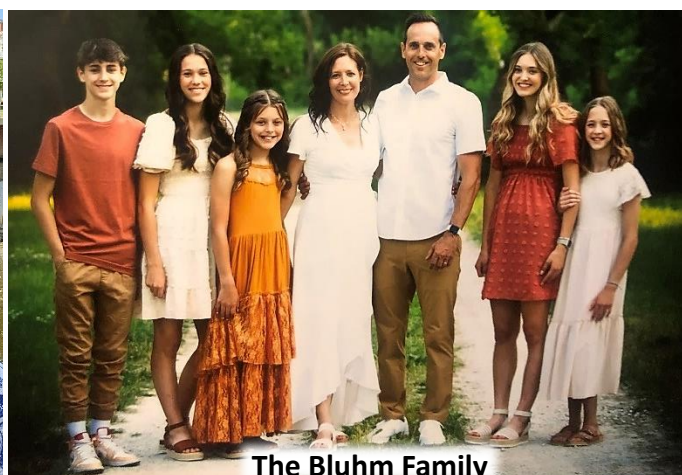
The Bluhm Family