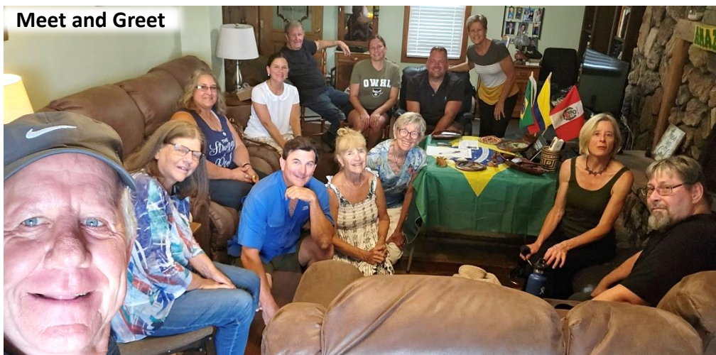
Meet and Greet