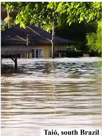
Taió, south Brazil

Sever dry season in the north and flooding in the south.