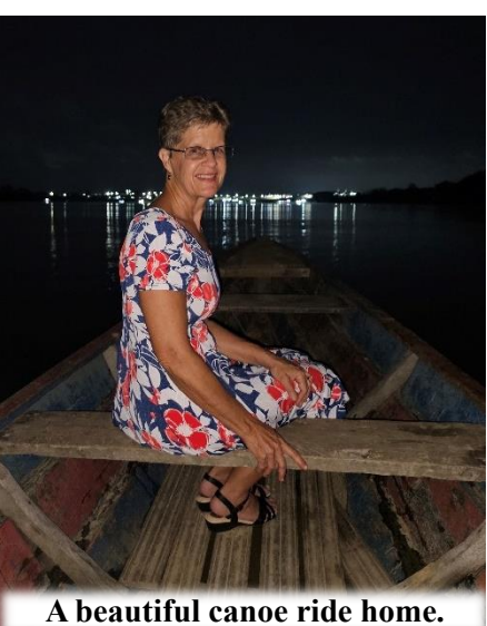
A beautiful canoe ride home.