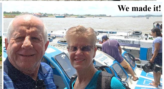
We made it!