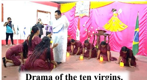
Drama of the ten virgins.