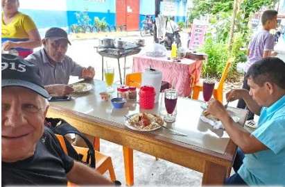
The leaders are starting to arrive!