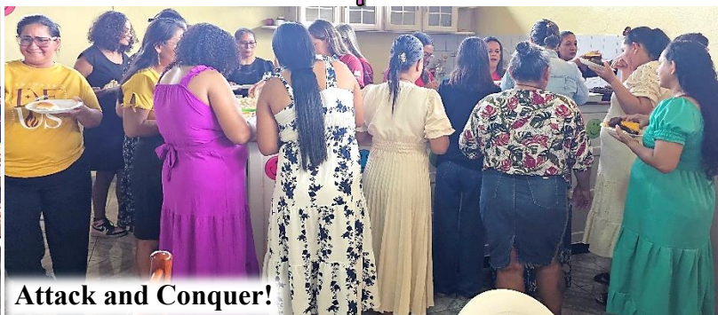
Attack and Conquer!