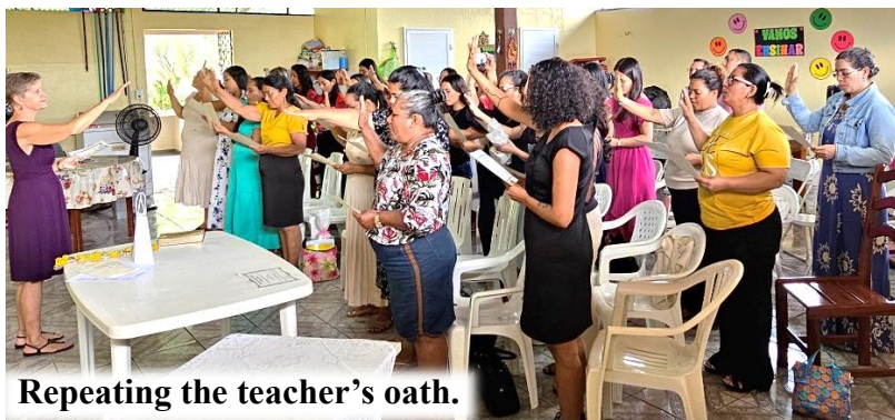
Repeating the teacher's oath.