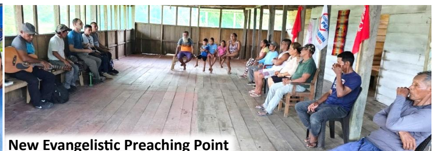
New Evangelistic Preaching Point