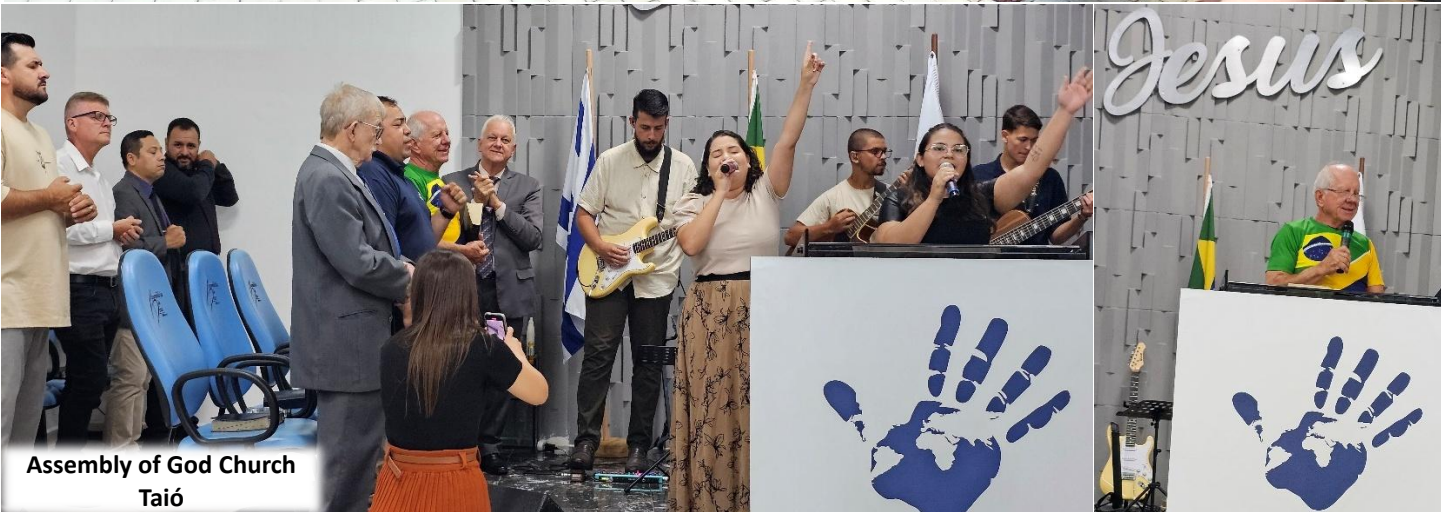
Assembly of God Church Taió