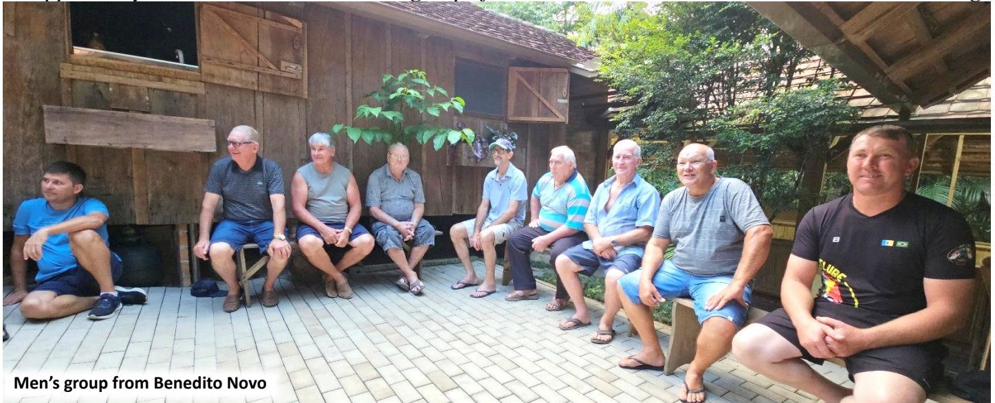
Men's group from Benedito Novo